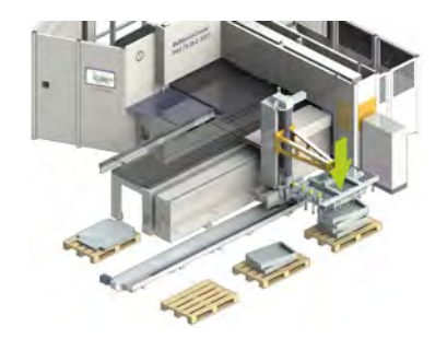
Horizontal stacking of a bent part on a pallet