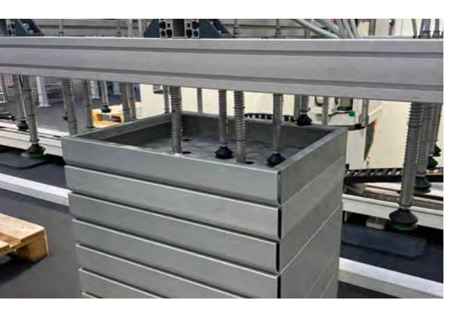
Loading system for automatic feeding of blanks from a stack of sheets with sorted and edge-precisely stacked sheets

Increasing speed and efficiency: In response to many customer requests for simple automation of the proven Multibend Center, we have developed the RAS Multibend Center ECO for automatic loading and unloading.