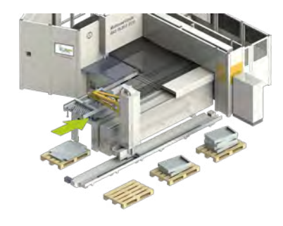
Separating and loading a blank with the RAS Palletizer loading system