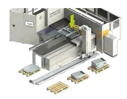
Picking up the bent part by the suction frame of the palletizer